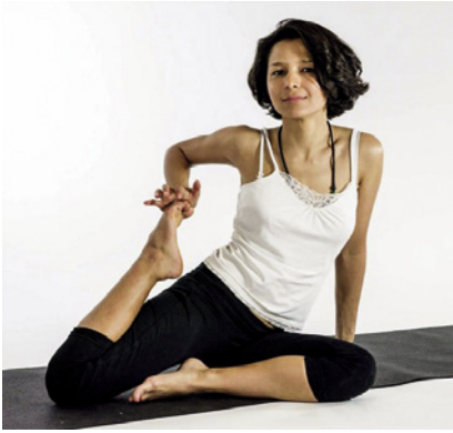
Picture 2. New femininity in modern yoga