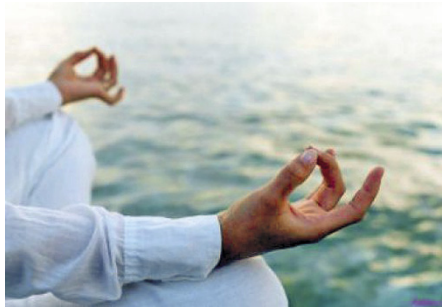
Picture 4. Neutral image of the body in yoga practice

explicit gender references) image of yoga practice within a natural context. In order to describe the new femininity ideal in modern yoga we start with a comparison of the first two photos and then proceed to the third to show the hidden meaning of its non-oppressive character.